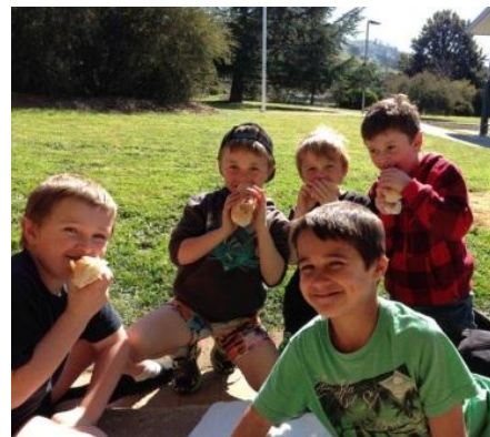
Students enjoying jellybeans, ice blocks and hotdogs