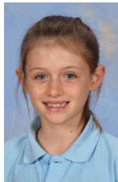
Bindi Crane Junior Girls Relay