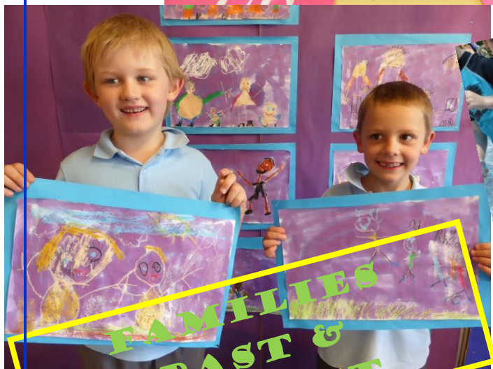
FAMILIES PAST & PRESENT