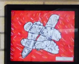
Cayden Wescombe Ava Doughty