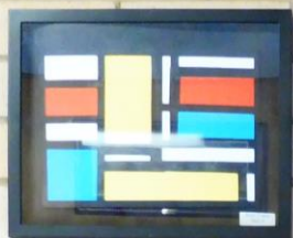
Bindi Crane Sid Cotterill