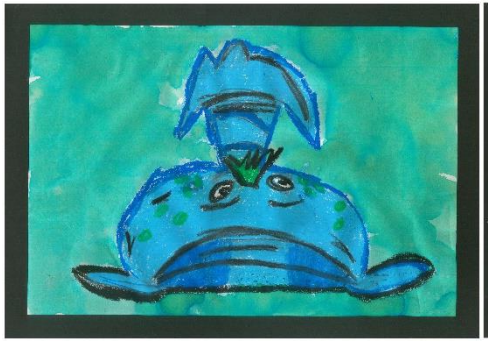
Thea Lindley Kinder Blue