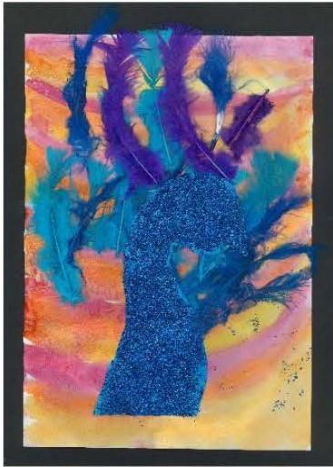
Darcey Waddell Kinder