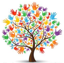
Sundagai Public School P&C

Our next P&C meeting will be held on Monday 28 October at 6:00pm in the school staffroom. Everyone is welcome to attend. For those who have not attended a P&C meeting and would like to see what the P&C does and how it operates this would be a perfect opportunity. We hope to see you all there.